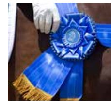
CENTRAL August 17-18