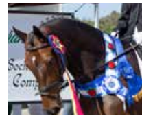
SOUTH July 19-21