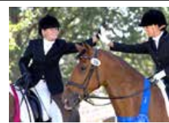
NORTH August 23-25